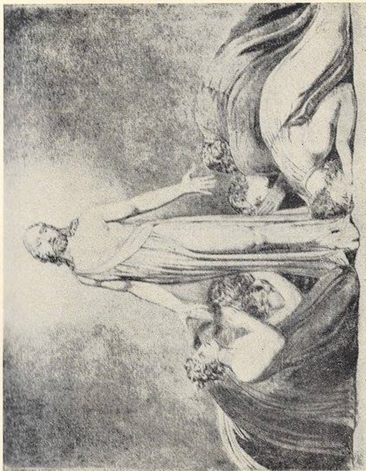
CHRIST APPEARING TO THE APOSTLES AFTER THE RESURRECTION By William Blake Philadelphia Museum of Art